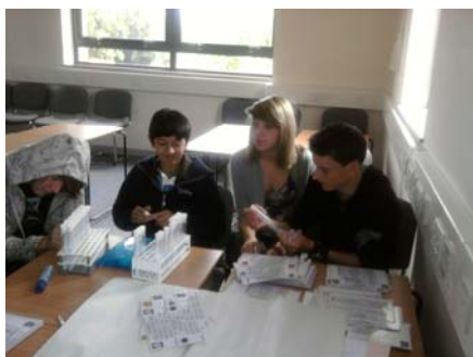
Enterprise / business activity, Making and selling soap Year 10