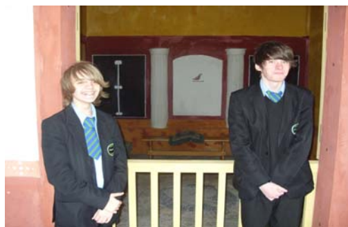
Representing Ercall Wood at the Opening of the Roman Town house Wroxeter Year 9