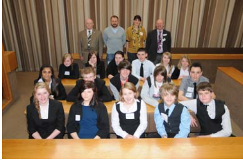
The Mock Trial Team 2011 Years 8 and 9