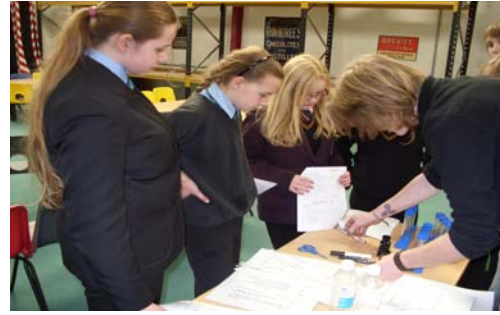
Forensic science workshop Year 7